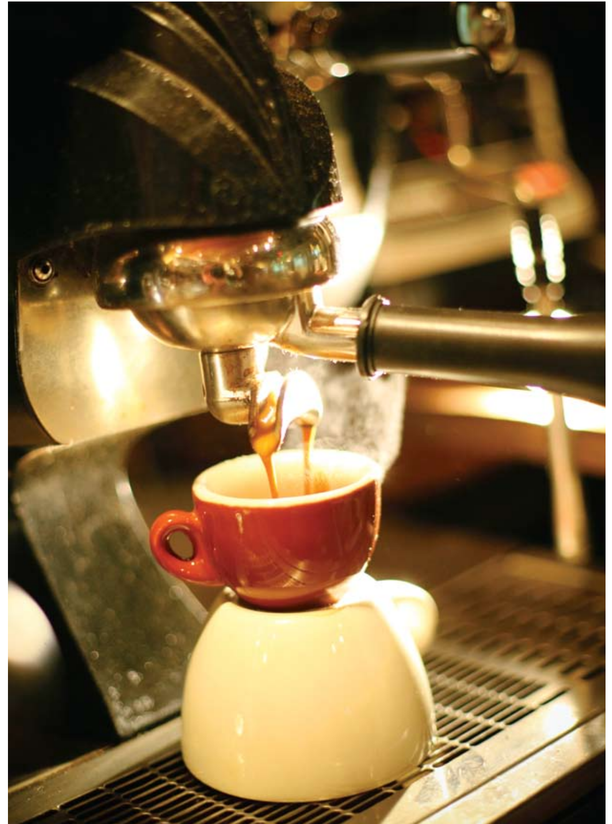
Caffe Driade knows coffee: For its outstanding product, the Specialty Coffee Association of America awarded the cafe its highest honors four years in a row.