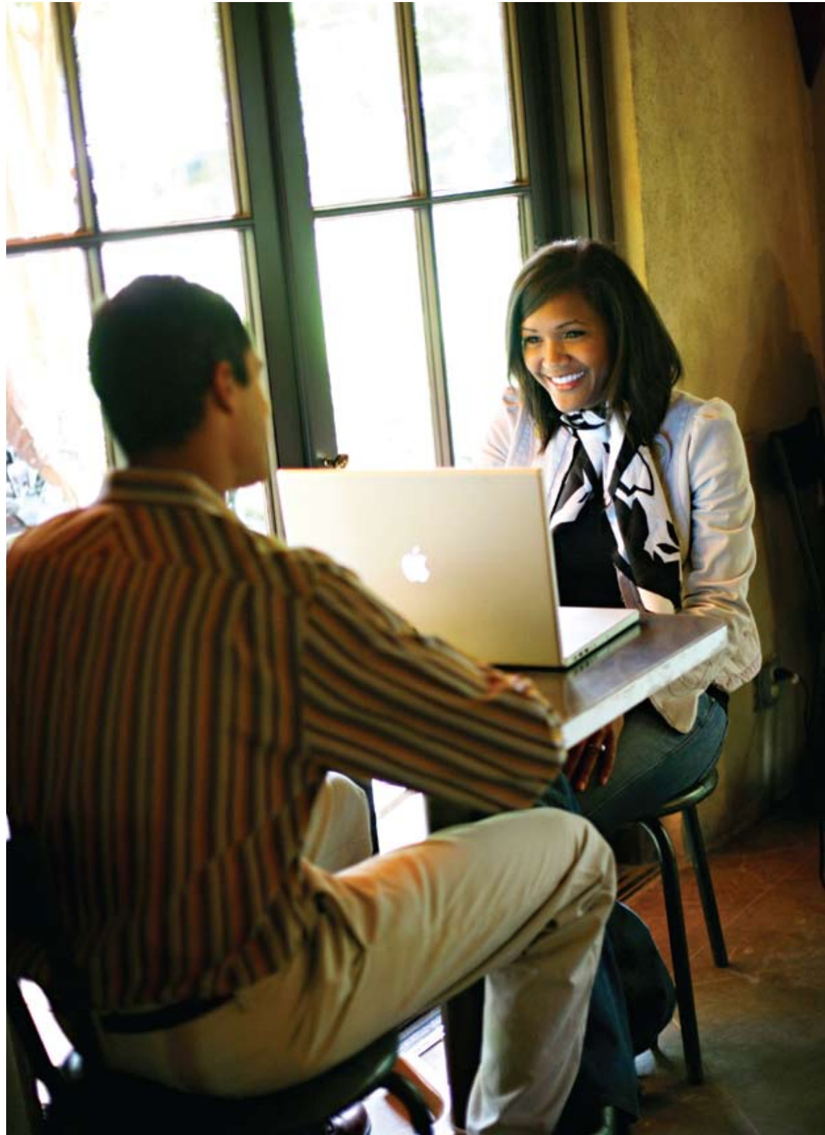
Caffe Driade's intimate atmosphere is ideal for quiet conversation, reading, or studying.